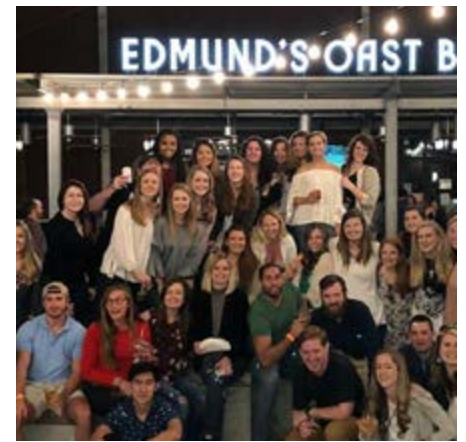
In April, some students gathered at Edmund's Oast to take a little study break before the start of exams.