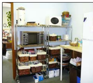
(left) The volunteers get ready to organize the kitchen (see right) .

The event was hard work, the outcome was amazing and overall it proved to be a great community experience.