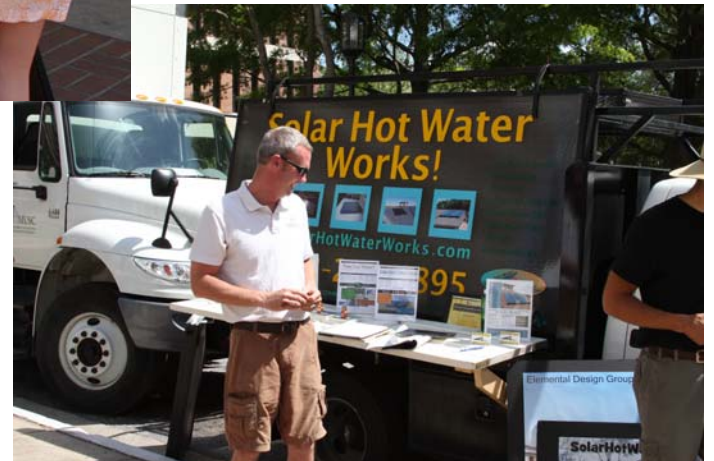
Solar Hot Water Works