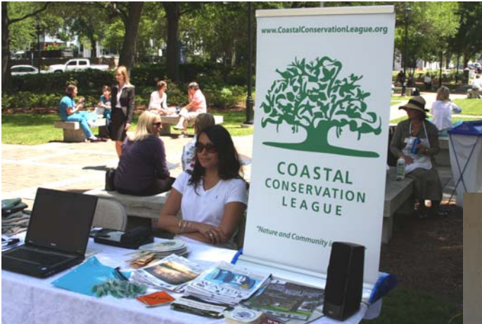
Coastal Conservation League