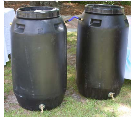
Rain Barrels from Cloudstream Water Harvesting