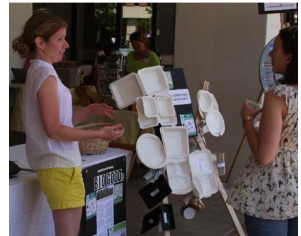
Compostable service ware from Southern Sustainable Resources