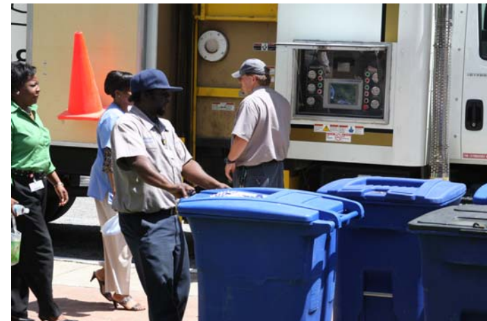
... we shredded paper!