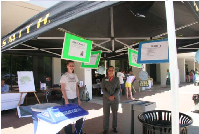
Waste stations were clearly marked and volunteers monitored the trash sorting