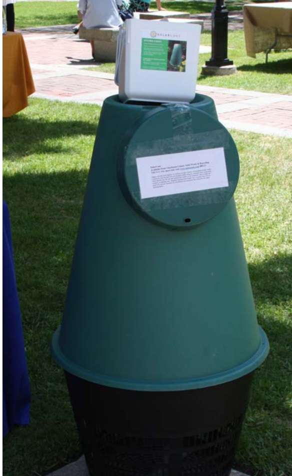
Garden Composter from Charleston County