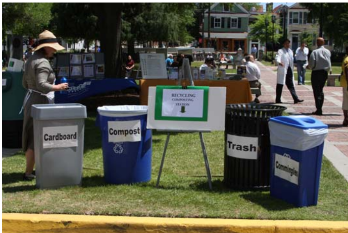
We collected compost and recycling...